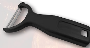
"Y"/Wishbone Style Peeler