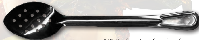
13" Perforated Serving Spoon