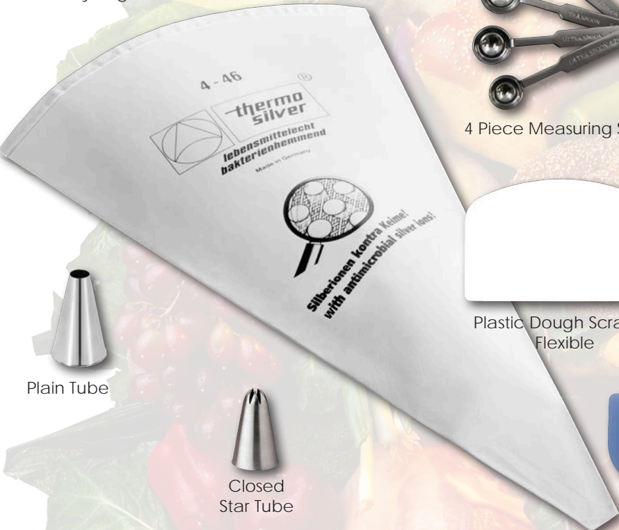
18" Pastry Bag, Anti-Bacterial