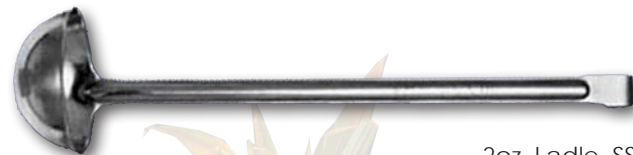
2oz. Ladle, SS