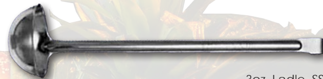
3oz. Ladle, SS