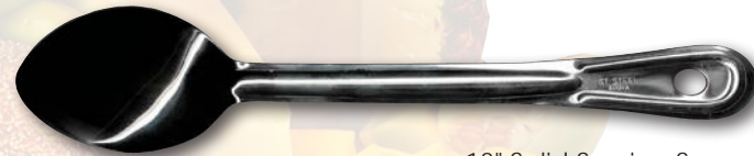
13" Solid Serving Spoon