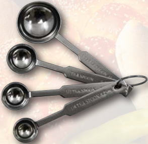
4 Piece Measuring Spoons