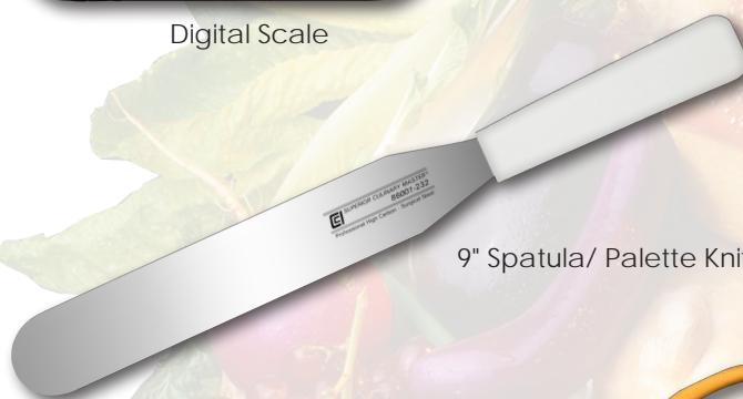
9" Spatula/ Palette Knife