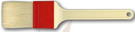
2" Pastry Brush, Natural Fibers