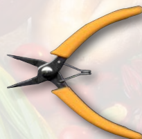
4½" Mini Pliers, SS