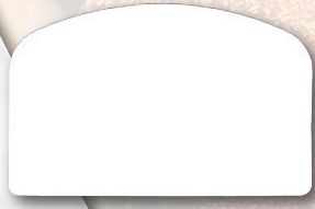
Plastic Dough Scraper, Flexible