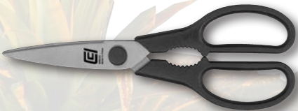
Take-A-Part Kitchen Shear