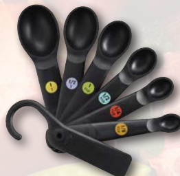
6 Piece Measuring Spoon Set