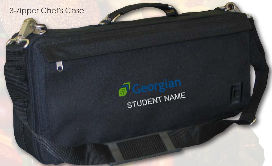
3-Zipper Chef's Case